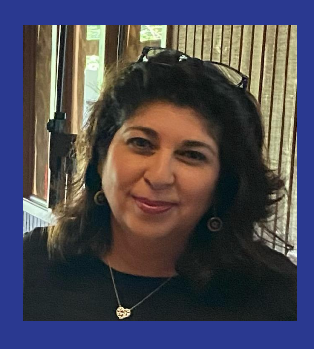
6th grade A - M 7th grade